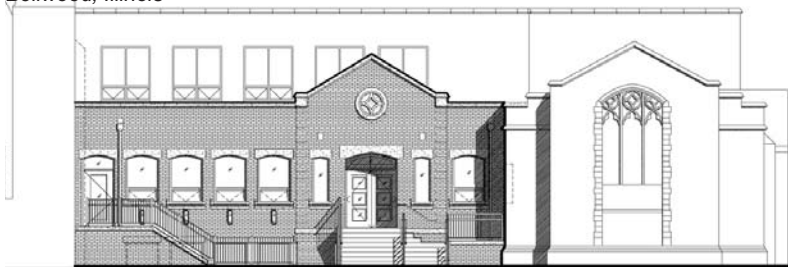
Building Addition at the First United Church of Oak Park