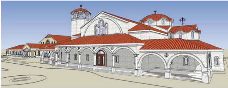
New Church for the Ascension of Our Lord Greek Orthodox Church Lincolnshire, Illinois